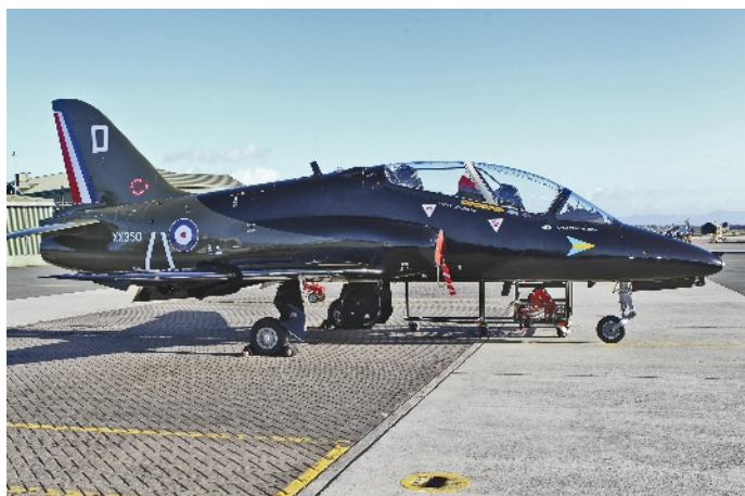
XX350 in WWI Paint Scheme

Until next time air combat over the Mediterranean is calling followed by French cuisine.....Au revoir.