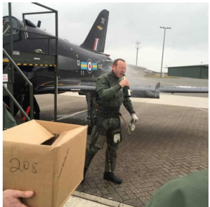
In The Face!!!