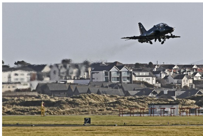
XX350 Maintenance Test Flight