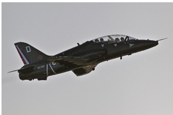
XX350 in Flight