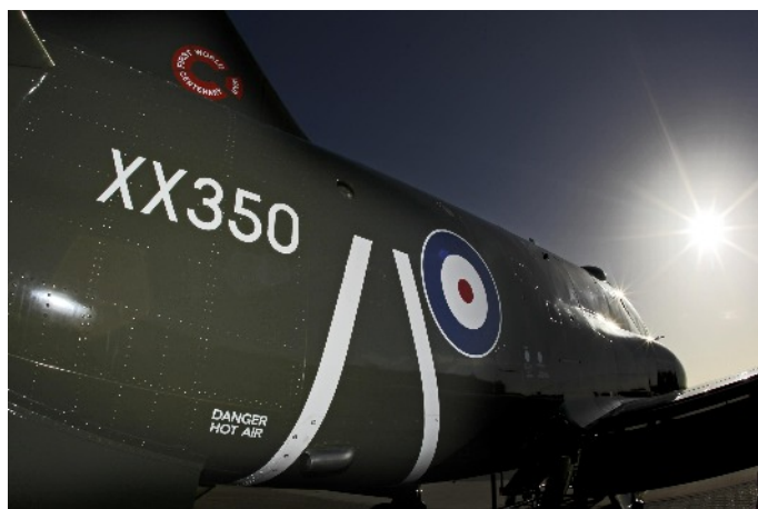
XX350 Rear Section