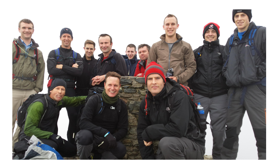
Completion of Ex Million Feet

The Sqn$ AT aspiration for the year has been accomplished! Ex Million Feet, climbing 1.1 million feet to represent the 1.1 million flying hours of the legendary Hawk T1 was completed over the past year with AT days all over Snowdonia. On most of the days the team endured the harsh Welsh weather whilst conquering such ranges as the Glyderau, Carneddau and Yr Wyddfa or completing different mountain bike courses throughout the National Park. 208 completed the challenge on Fri 14 Nov with the final ascent of Snowdon.